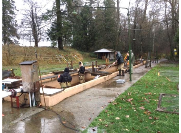
Students assisting in the weekly cleaning of the trout rearing channels

The Club has a long relationship with Earl Marriott. This year a fundraiser for the school rugby team will be held in the Club hall in February and the school Junior Prom is scheduled for May.