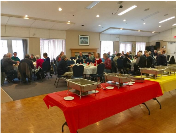
Close to 50 volunteers and guests attended the luncheon

The Club's biggest asset is our volunteers!