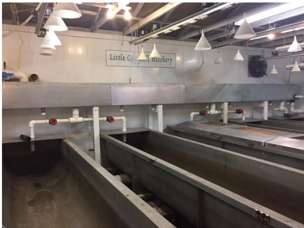
East side head trough now complete - before (above) and after